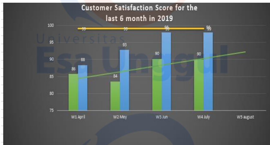
Gambar 5 Performance NCE and CE monthly