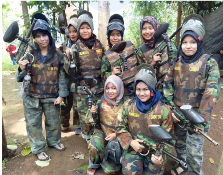
Gambar 7 Employee Gathering (Paintball)