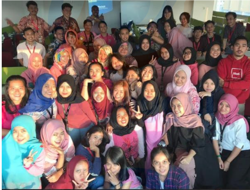
Gambar 13 Weekly Briefing