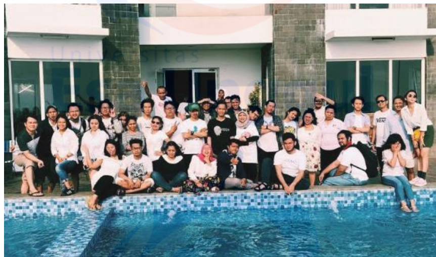
Gambar 8 Employee Gathering (Anyer Beach)