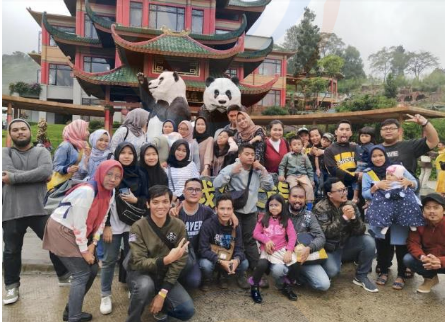
Gambar 9 Employee Gathering (Taman Safari)