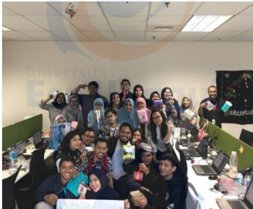
Gambar 10 Exchange christmas Gift