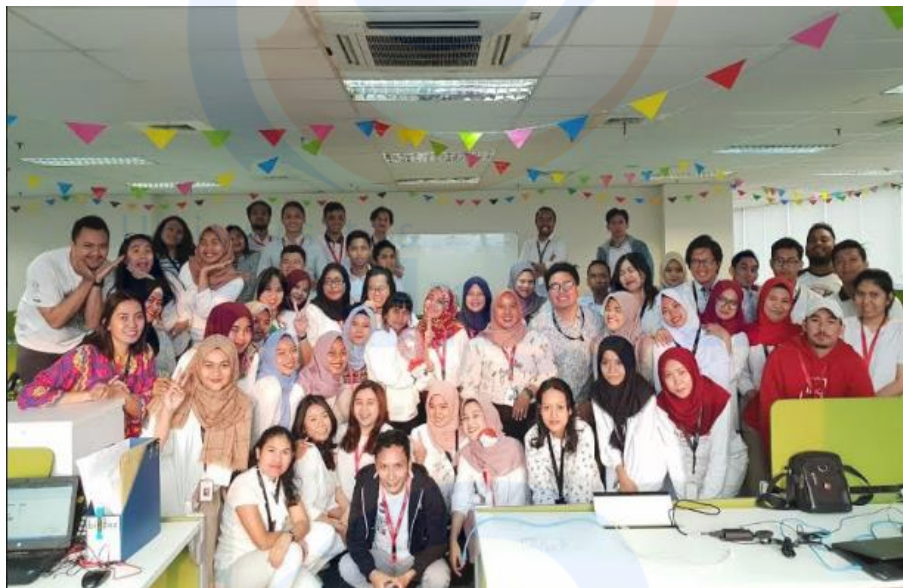
Gambar 14 Kegiatan Lomba Dekorasi Ruang Perayaan 17 Agustus